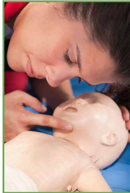
A woman learning CPR on a baby manikin