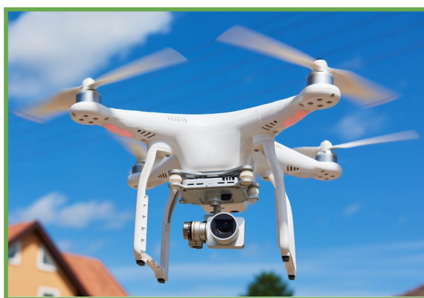
A drone on the lookout!

➤ In some schools, students learn to build robots? Can you guess what name is often given to the room where robots are built?